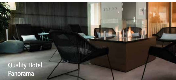
Quality Hotel Panorama